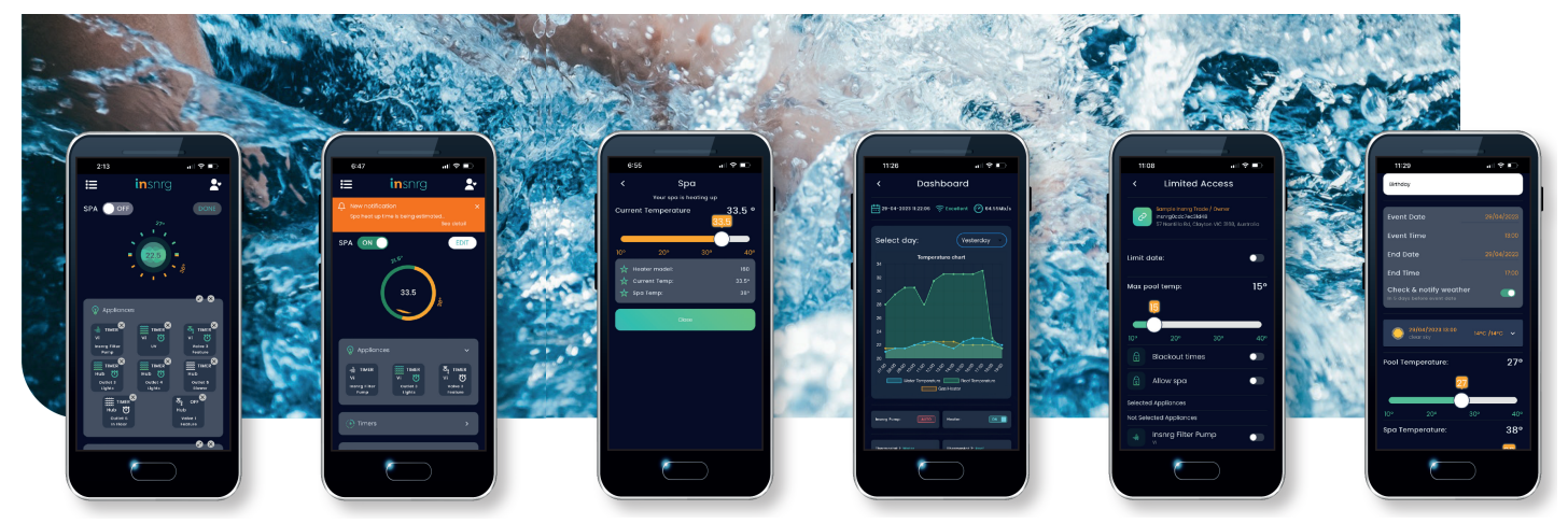
EXPANDABLE FOR THE LARGEST SYSTEMS

Use the invitation function to allow full or limited access by friends, family or guests.